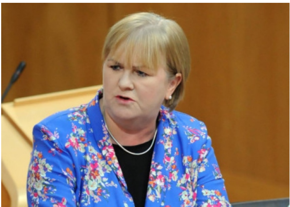
Welcome to today's edition of First Minister's Questions. I see Labour's Johann LaMont has just been handed her script. So let's go straight to the debasing chamber and listen to the words of Pall Sink-Layer.

By Big Brian Taylor-Trash, our Political Editor and former Head of Bias.